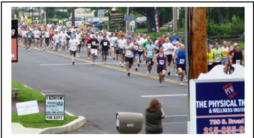
Broad Street ReRunners Headed Down South Broad Street in Lansdale

PTW—Physical Therapy & Wellness Institute—has been offering quality care for those recovering from injuries, surgeries, muscle traumas and skeletal disorders since 2002. PTW also offers pre-operative conditioning, medically based exercise programs, and sports training services with locations in Lansdale, Montgomeryville, and Quakertown, PA.